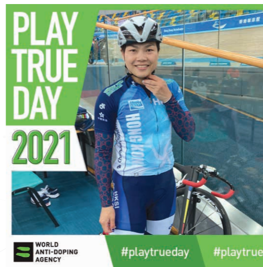
李慧詩 LEE Wai Sze